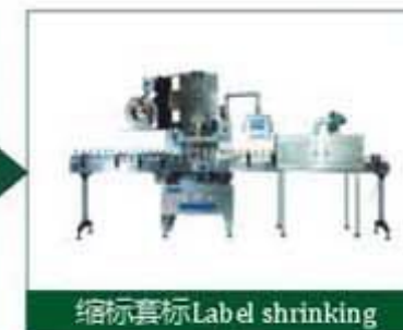
缩标签 Label shrinking