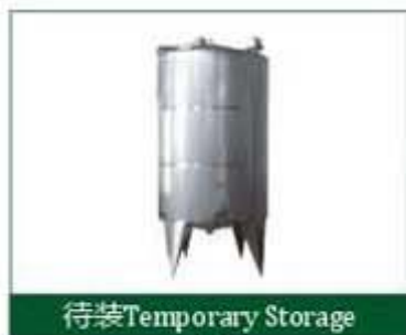
待装 Temporary Storage