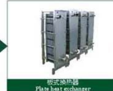
板式换热器 Plate heat exchanger