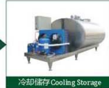
冷却储存 Cooling Storage