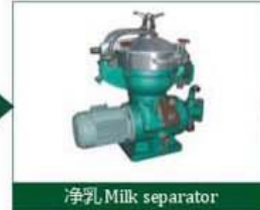
净乳 Milk separator