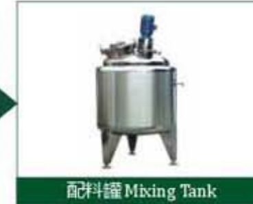
配料罐 Mixing Tank