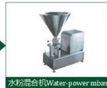
水粉混合机 Water-power mixer