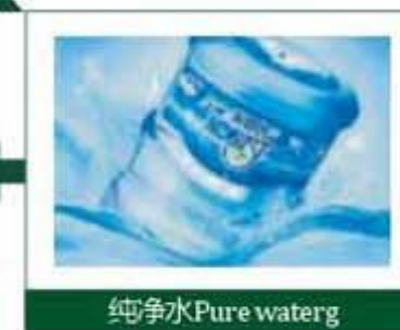
纯净水 Pure water