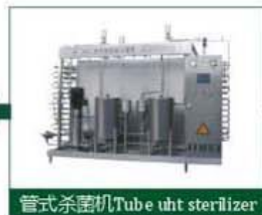
管式杀菌机 Tube uht sterilizer