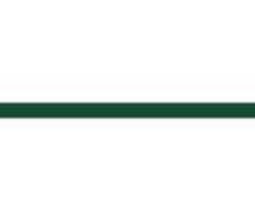
纸质砖型液体包装机 Paper brick-shaped packaging machine