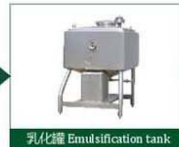
乳化罐 Emulsification tank