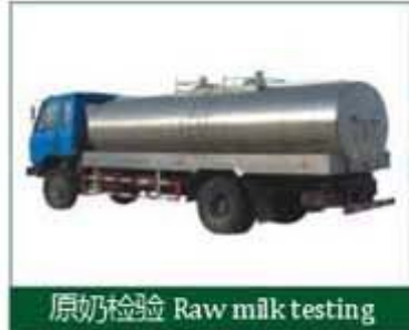
原奶检验 Raw milk testing