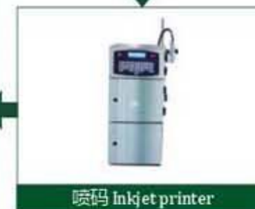
喷码 Inkjet printer