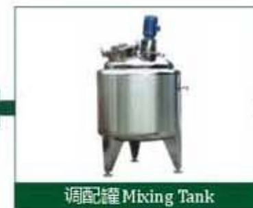
调配罐 Mixing Tank