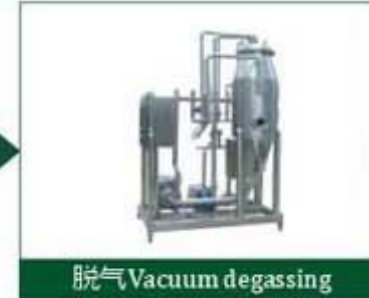
脱气 Vacuum degassing