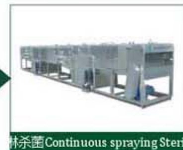
淋杀菌 Continuous spraying Sterilizer