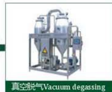
真空脱气 Vacuum degassing