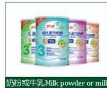
奶粉或牛乳 Milk powder or milk