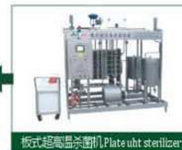
板式超高温杀菌机 Plate uht sterilizer