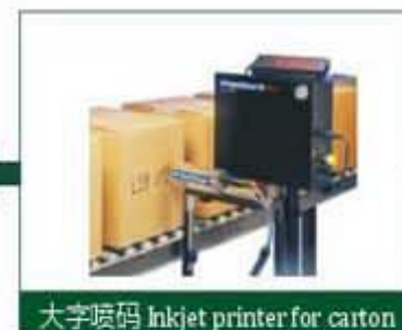
大字喷码 Inkjet printer for carton